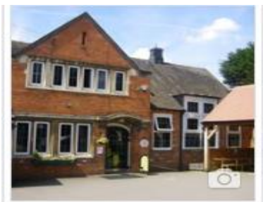
The Avenue Infant School @TheAvenueInfantSchool

ALSO FOLLOW US ON .... FACEBOOK AND TWITTER